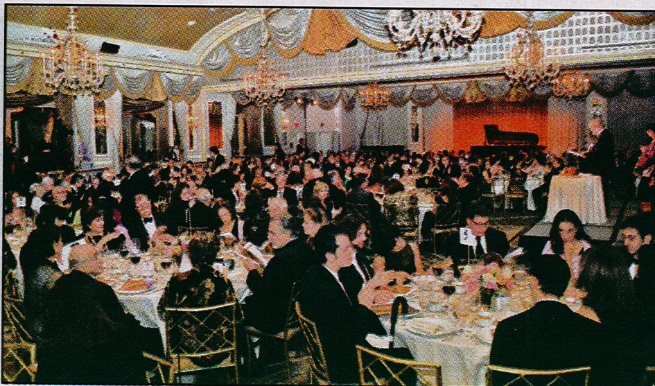
The Grand Ballroom at the Pierre Hotel in New York City was filled to capacity for the American Sephardi Federation dinner.